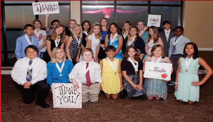
25 students were signed to the Take Stock In Children Program in 2013-2014

Every donation to the Bay Education Foundation's Take Stock In Children program is matched dollar for dollar by the Florida Prepaid College Foundation.